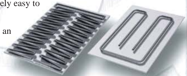
Digital Knight SuperCoil-Microwinding™ heat platen